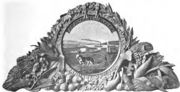
GREAT SEAL OF KANSAS.